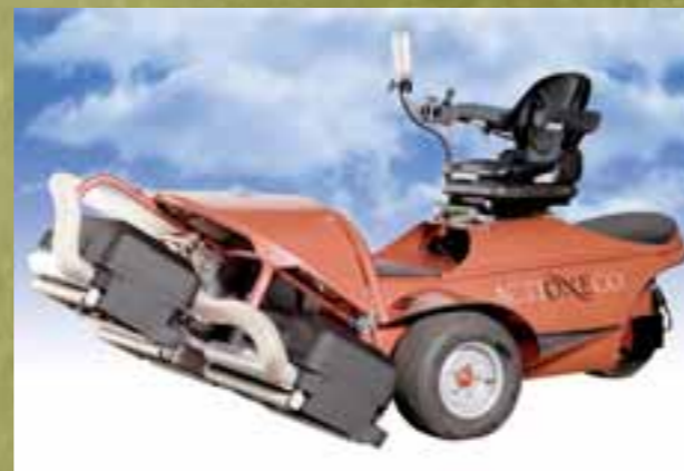
Electronic traction control and high wheel torques for uphill drive.