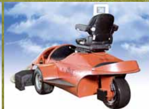
3-wheel drive and turning on spot around centre point between front wheels.