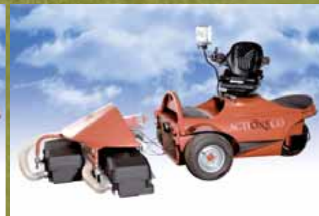
Optional equipment available for the increase of the investment utilization.